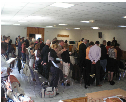
Eglise Protestant Evangelique de Tarbes

Pray for us as we engage this church in missions.