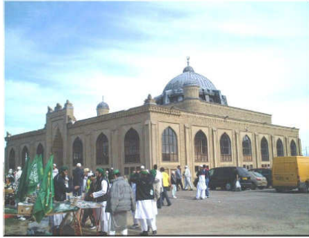
A MOSQUE IN BRADFORD, ENGLAND